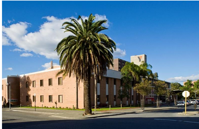
Outpatient Clinic Building, Goderick Street

Please be advised that the Outpatient clinics located at O Block, Goderick Street, are approximately a twenty minute walk from the main Royal Perth Hospital Multistorey Carpark, on Moore Street.