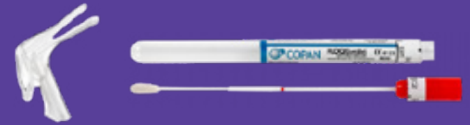
Small speculum by Welch Allyn. FLOQSwabs® 552C by COPAN (red top)